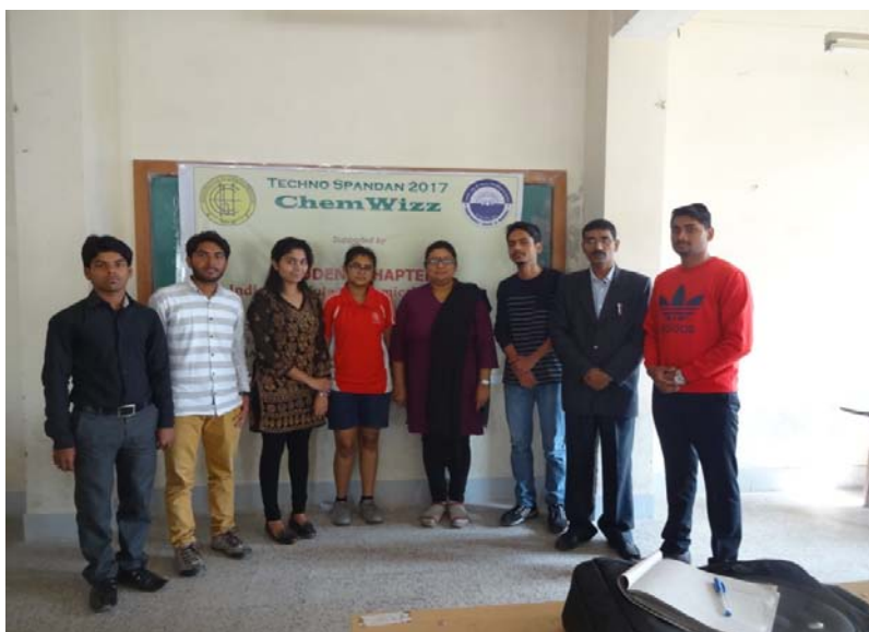
(Photograph of Activity 4)

Each one from total five Second and Third winners was provided with a hard bound note pad.