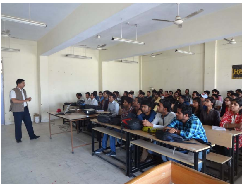
(Photograph of Activity 5)