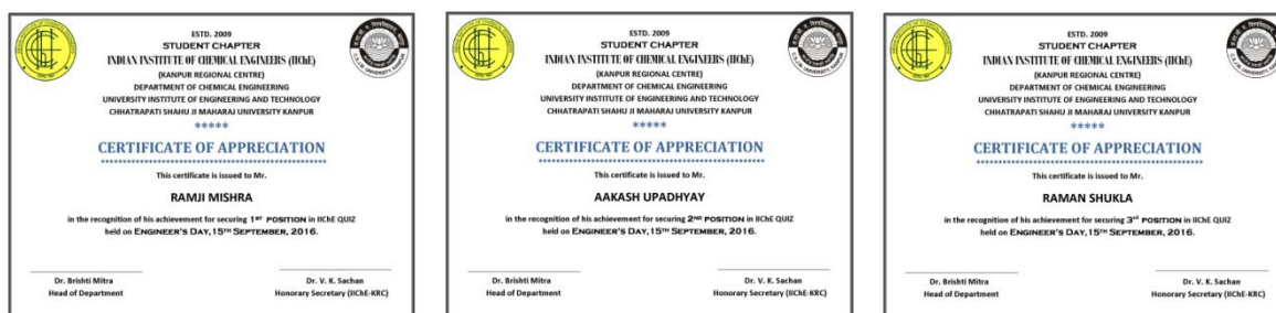
(Certificates of Activity 2)