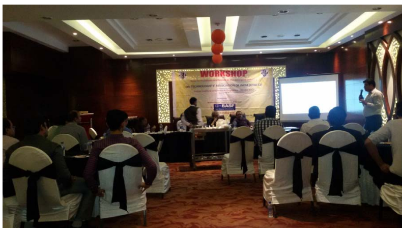
(Photograph of Activity 3)

Activity 4: Quiz cum Presentation Contest: A Chemical Engineering Quiz (ChemWizz) was organised on 10 th Feb, 2017 at University Institute of Engineering and Technology (UIET) CSJM University Kanpur under the Student Chapter of IChE (KRC), Department of Chemical Engineering UIET Kanpur. The event was supported by IChE Kanpur Regional Centre with kind approval of the President. More than 50 students of UIET and Ambedkar Institute of Technology (AITH) Kanpur took part in written quiz followed by two rounds of technical presentation. Finally 8 students emerged as winner as below: